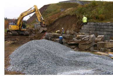
Battery 'B' project underway to rebuild retaining wall in the summer of 2010.

The Friends of Fort Knox funded repairs to Battery B and adjacent demisabstion walls that had been destabilized due to decades of freeze/thaw cycles due to poor drainage. This project was an extension of the Century and a Half masonry repair project, which began in 2008. In addition, significant efforts were made to curtail erosion problems at the repair sites and road in front of the Fort.