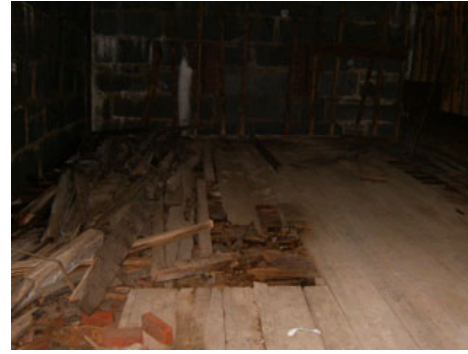
Powder magazine deterioration

The Friends wish to thank the Morton-Kelly Charitable Trust and the Messler Family Foundation for providing financial support for this restoration project.